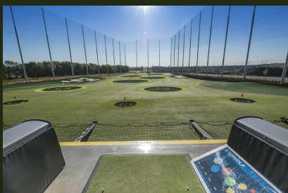
Photo looking out of a Topgolf bay at course.