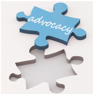
Blue puzzle piece w/advocacy in white 'popped' from background.

To apply for the Lorain County location , please visit our website for full eligibility, information, and the application. This location runs July 9th - 12th.