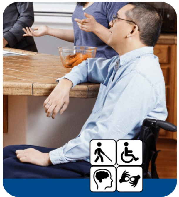
Photo: A man wearing a suit, in a wheelchair lounging against a kitchen island.

People with disabilities want to be part of the community and the work of Centers for Independent Living (CIL) is the key to independent living success.